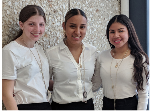
SkillsUSA is a partnership of students, teachers and industry working together to ensure America has a skilled workforce. SkillsUSA helps each student excel. We provide educational programs, events and competitions that support career and technical education (CTE) in the nation's classrooms.